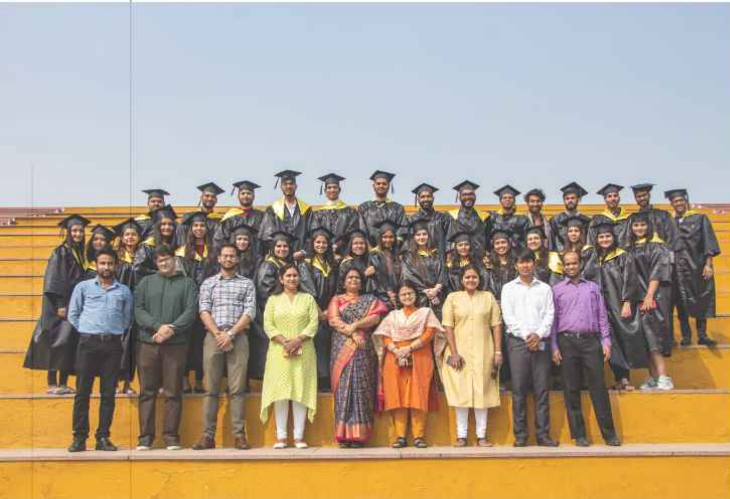
Graduating batch of 2014-2019

This book maps a wholistic journey of this school of 10+ years from first batch onwards, the extraordinary moments, achievements of students, alumni and faculties, students' works and their experiences reflecting the learning environment that is needed for this design profession in order to explore the newer skies.